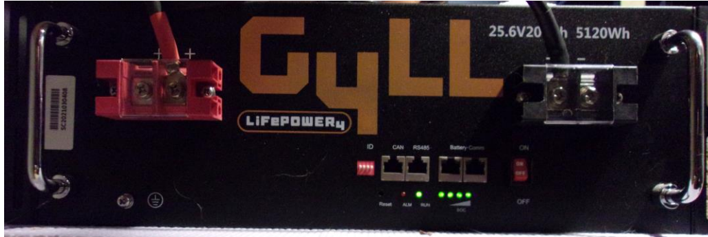
Close up of the server rack battery